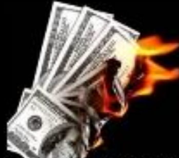
HOW THE STATION OWNERS THINK OF US