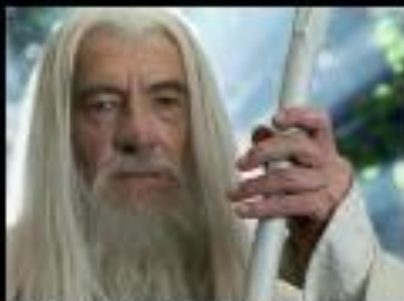
HOW PEOPLE THINK OF US WHEN WE FIX THEIR COMPUTER