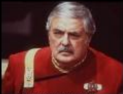
HOW WE THINK OF OURSELVES