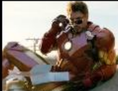
HOW WE WISH WE WERE