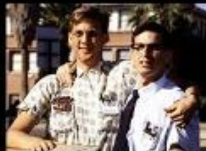
HOW PEOPLE THINK OF US THE REST OF THE TIME