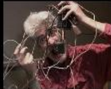
HOW WE REALLY ARE