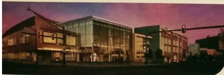
The Greater Columbus Convention Center

The Society of Broadcast Engineers 2023 SBE National Meeting will be held in Columbus, OH, on Sept. 27-28, 2023. The event will be held in conjunction with the Midwest Broadcast & Multimedia Technology Conference (MBMTC), presented by the Ohio Association of Broadcasters, the Indiana Broadcasters Association, the Kentucky Broadcasters Association and the Michigan Association of Broadcasters.