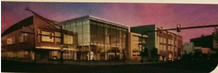
The Greater Columbus Convention Center

The Society of Broadcast Engineers 2023 SBE National Meeting will be held in Columbus, OH, on Sept. 27-28, 2023. The event will be held in conjunction with the Midwest Broadcast & Multimedia Technology Conference (MBMTC), presented by the Ohio Association of Broadcasters, the Indiana Broadcasters Association, the Kentucky Broadcasters Association and the Michigan Association of Broadcasters.