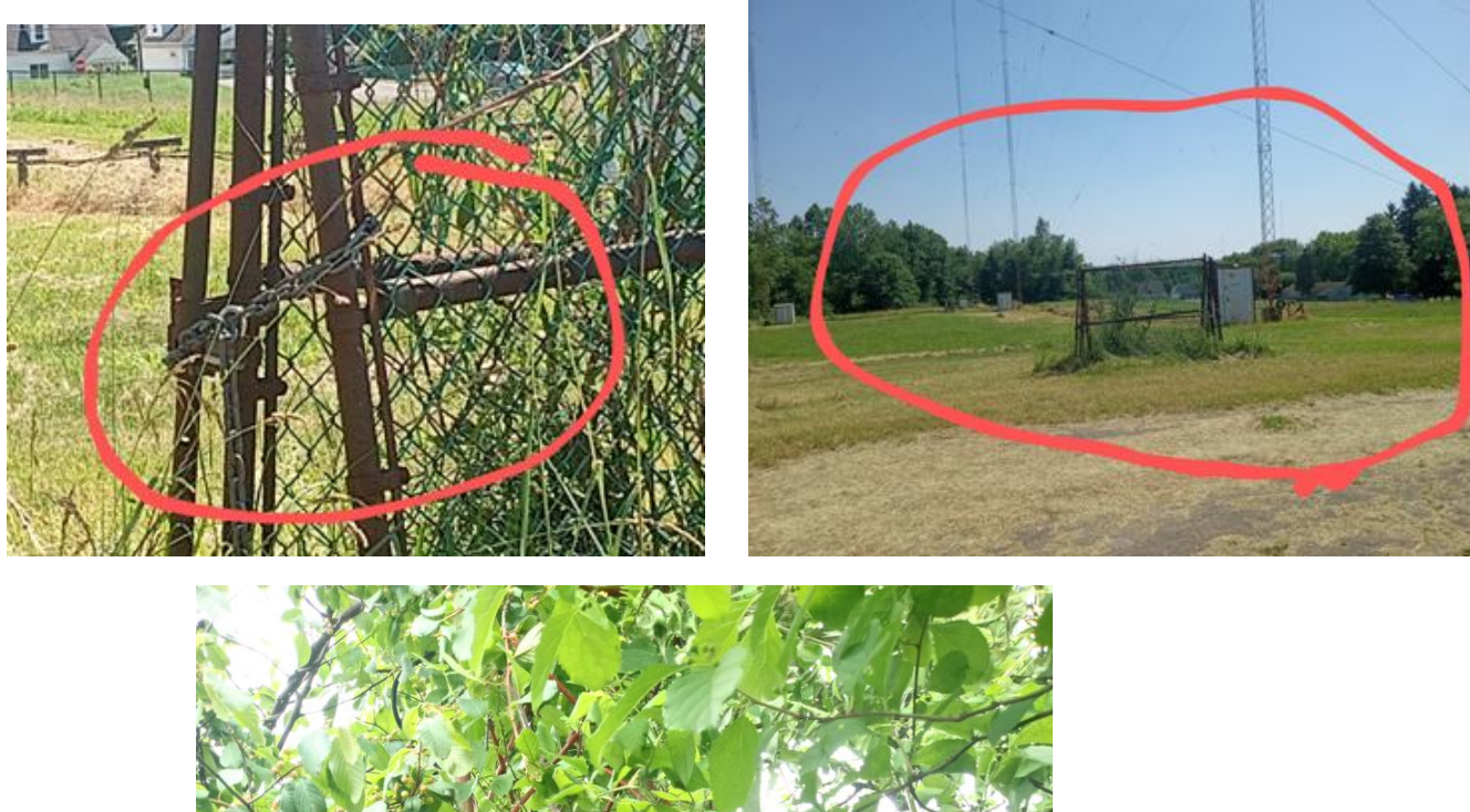
WELL The gate is closed and locked ! (and a minor issue with the actual fence)